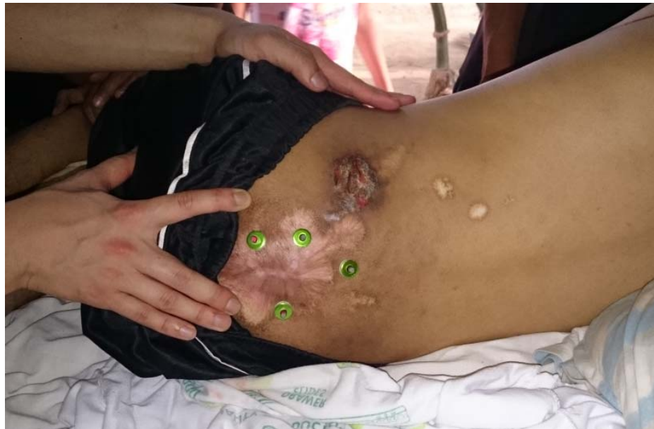
Treatment of moxibustion to injured area