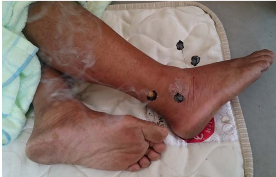
Treatment for right ankle pain