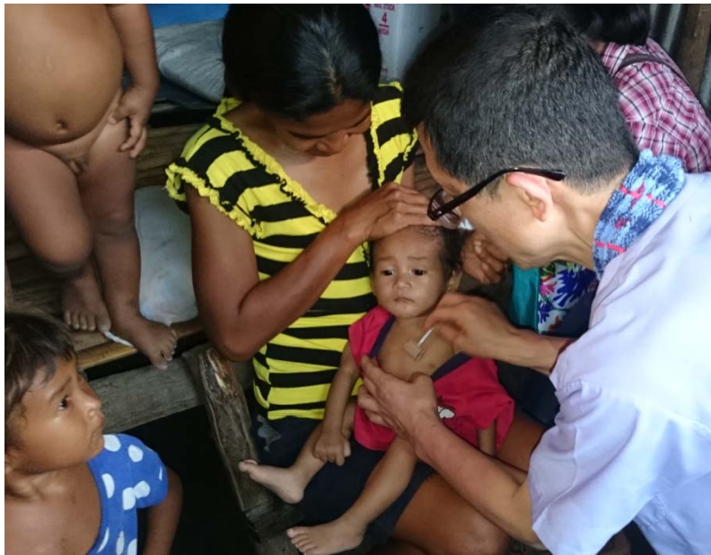
Treatment of cough in malnourished children