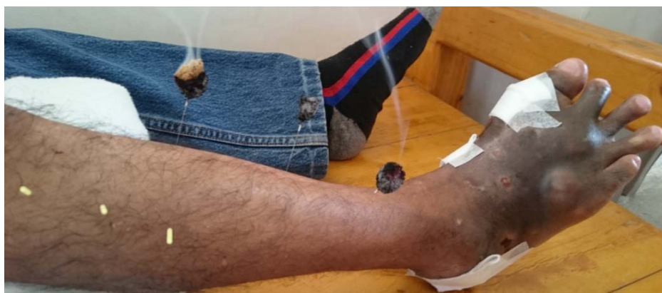
Treatment of right foot pain (infection)