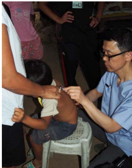
Treatment of child cough