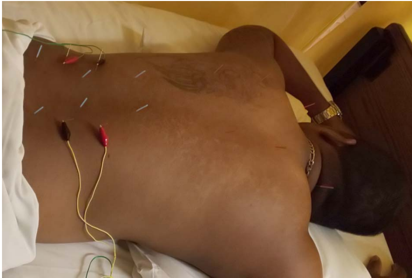
Low back pain