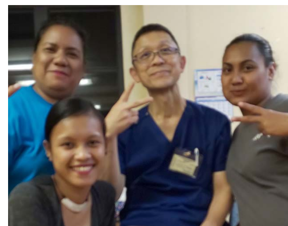
Physical therapist staff