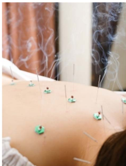
Low back pain