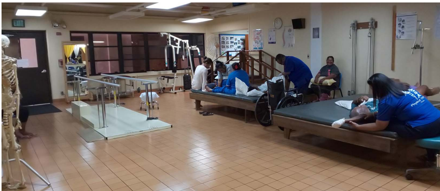
Physical therapy room