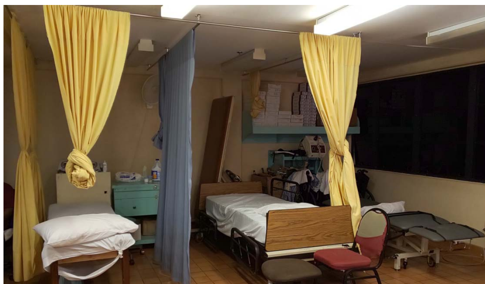
Performed acupuncture here