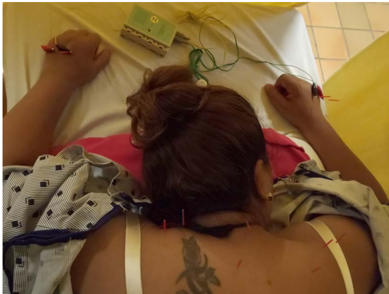
Stiff shoulder and hand numbness